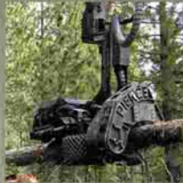
HARVESTER/ PROCESSOR HEADS