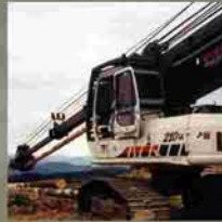
MONOBOOM/ TELESCOPIC DELIMBERS